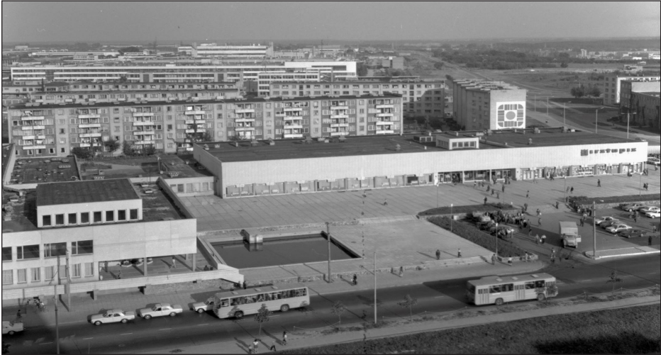
Figure 3: Girstupis shopping centre in Kaunas, 1978.

monumentality of the cultural hub, the square paved with large slabs and shaped at the shopping centre and the clear layout of the shopping centre offering a good sense of direction for buyers. 54 (Fig. 3)