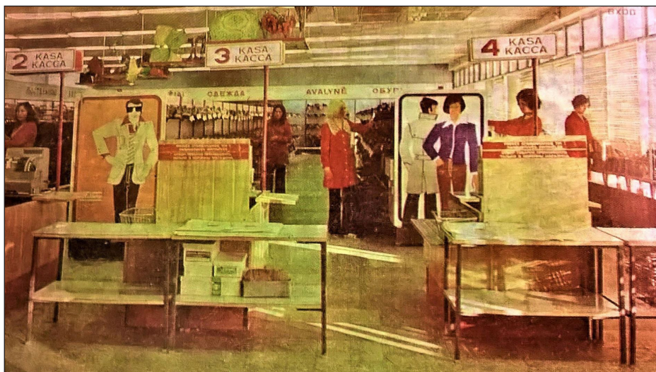
Figure 9: Interior of the shopping centre Saulėtekis in Kaunas, 1978.