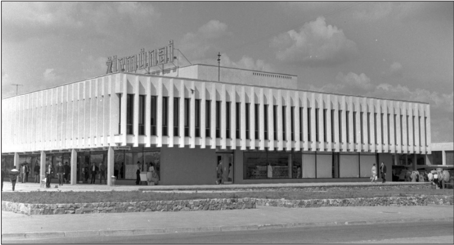
Figure 1: Žirmūnai shopping centre in Vilnius, 1969.

the fact that it was one of the first shopping centres of this kind, the new building was named as an experimental commercial/household centre. It contained a department store, post office, telephone station, savings bank, grocery store, vegetable store, restaurant, pharmacy, water syphon filling station, hairdressing salon/barbershop, chemical cleaning and dyeing shop, watch repair shop, laundry etc. 48 According to the architects of that time, the shopping centre under discussion enabled the analysis of advantages and disadvantages of this new type of commercial building as well as the observation of population assessments. 49 Shortly afterwards, the construction of similar centres was started following Aronas' models in other cities of the LSSR. However, to meet more effectively commercial needs such as an increase in the area of commercial spaces for the laying out of goods in special containers or for the usage of advertising measures, adjustments to the standard designs were often applied. 50 (Figures 1 and 2)