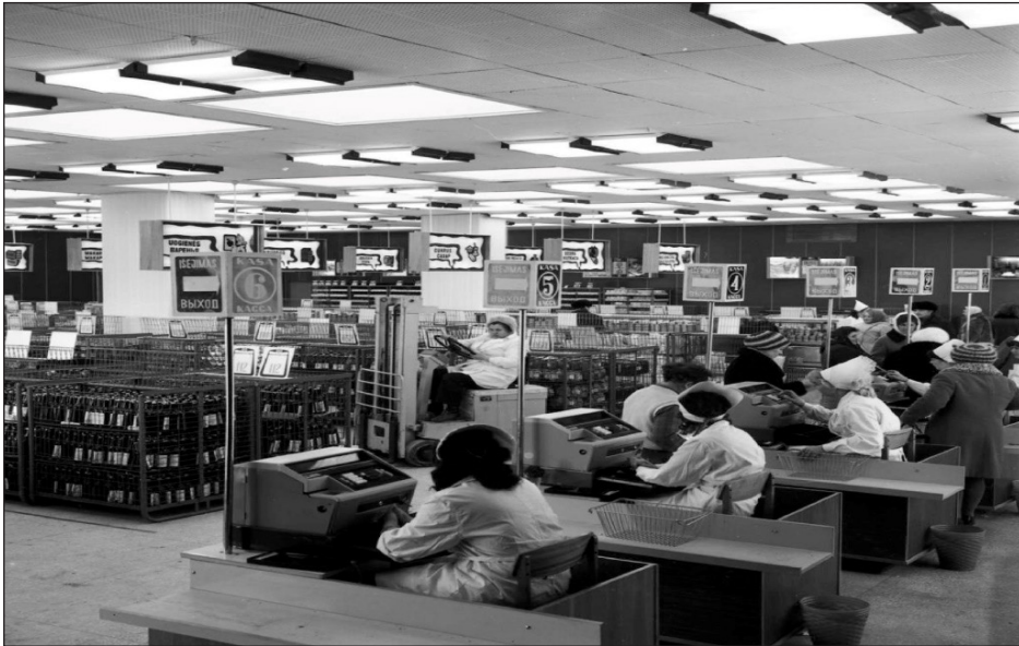
Figure 11: Interior of the shopping centre Debrecenas in Klaipėda, 1974.

The promotional leaflets of shopping centres were also used to enhance the architectural image of shopping complexes as efforts were made by Soviet propaganda to underline the construction achievements of Soviet commercial buildings. In light of the above, instead of introducing the goods available for sale, the promotional leaflets of a range of shopping centres emphasize the vast number of tons of steel and concrete used for the construction of shopping complexes along with the modern finishing materials and the visual design solutions for exteriors and interiors. For instance, "After opening the door of the shopping centre 'Papartis', you will be captivated by the original advertising and characteristic interior with ceramic tiles, laminated panels and organic glass used for its decoration". 76 In this way, printed information was employed to give a preconceived opinion to buyers about both the goods and the modern style of the very commercial building.