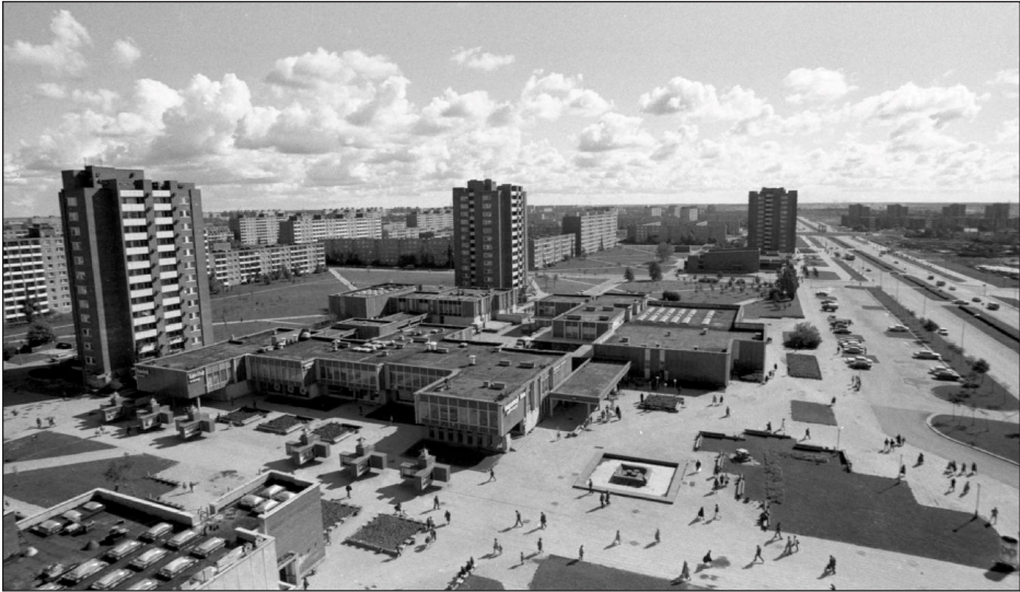
Figure 5: Debrecenas shopping centre in Klaipėda, 1982.

centres, "Aitvaras", located in the Third Residential Area and constructed in the middle of the 1970s, integrated a department store, bookstore, restaurant/cafe, post office with a telephone station, and movie theatre. Later, similar shopping centres of residential areas banding together a range of shops, pharmacies, catering outlets, libraries and other establishments were opened in the Fourth, Fifth and Sixth Residential Areas of Klaipėda. 60 (Figures 5 and 6)