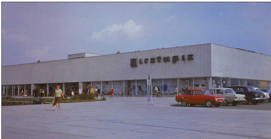
Figure 7: Facade and window displays of the shopping centre Girstupis in Kaunas, 1974.