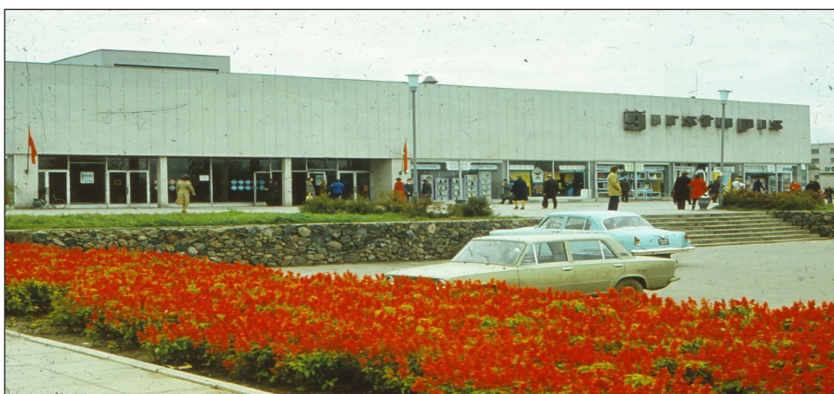
Figure 8: Facade and window displays of the shopping centre Girstupis in Kaunas, 1978.

Concerning the absence of advertising on the exterior of shopping centres, attempts were made to explain this situation by the rational advertising used in the interior of the shopping centres that was applied on the grounds of the responsive service of buyers and easing the complexity of the services provided. For instance, the advertising publication of the shopping centre "Vitebskas" located in the Kalniečių Residential Area in Kaunas declared that the "precious time of a buyer is saved by accurate and