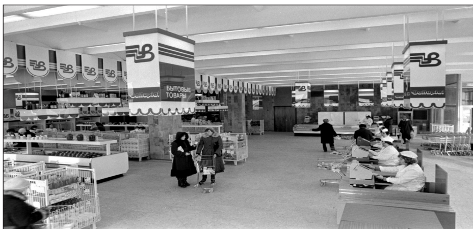
Figure 10: Interior of the shopping centre Baltupiai in Vilnius, 1982.