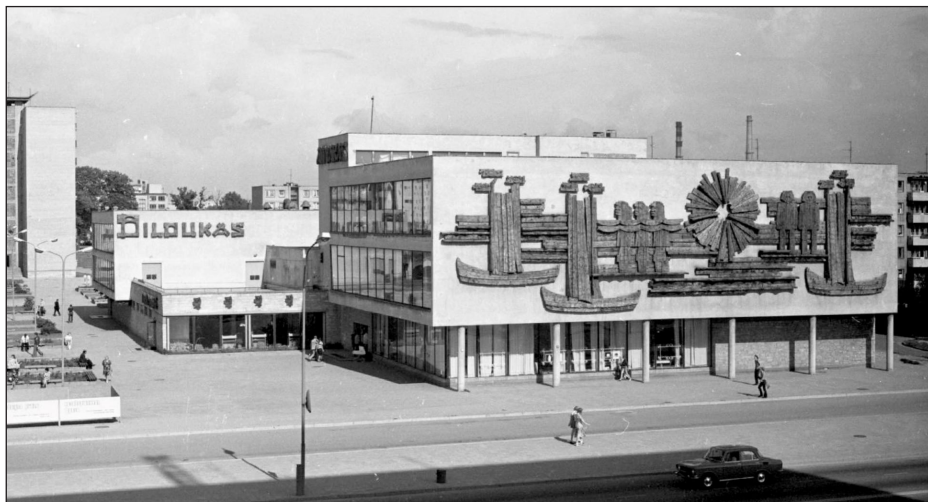
Figure 6: Aitvaras shopping centre and Bildukas restaurant in Klaipėda, 1977.

Actually, no city-wide shopping centres were found in the LSSR; however, such shopping centres as Žirmūnai, Stumbras, Girstupis, Kalniečiai, Šeškinė or Aitvaras having represented the key idea of Soviet shopping centres, that is to provide commercial and household services to settlers of mikrorayons and residential areas, used to extend their scope by their functions, thereby becoming city-wide attractions to the population, as due to the scarce supply of products shoppers were looking for goods in different commercial locations. In each residential area or mikrorayon, at least one shopping centre of a similar composition and functionality was situated. Although the plans for residential areas included more shopping centres with a great range of functions, analysis of the aforementioned sources has demonstrated that the construction of shopping centres was not so rapid as it was supposed to be, and therefore, smaller shops of a different nature were constructed in order to compensate for deficiencies.