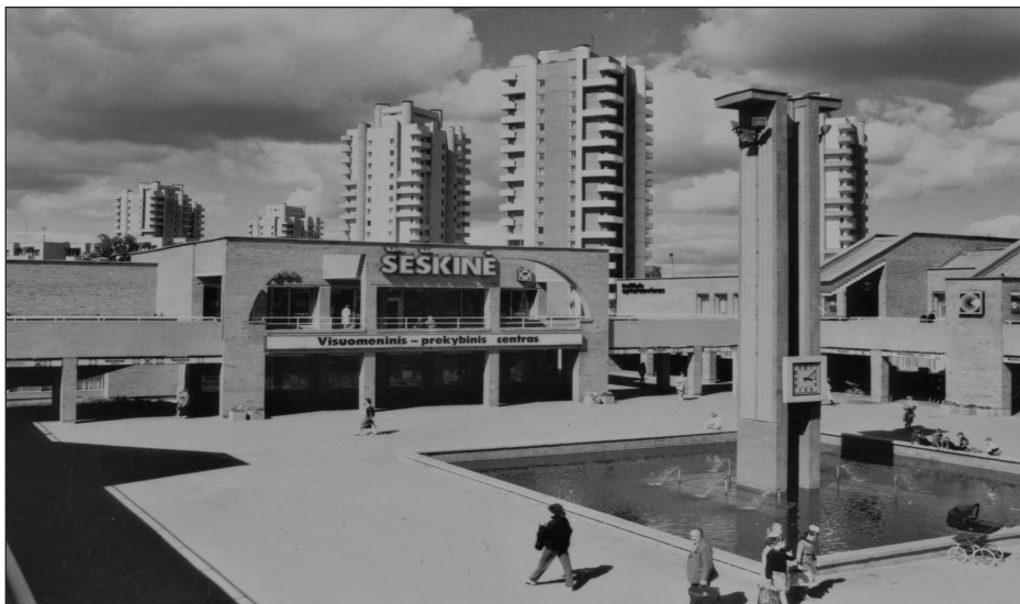
Figure 4: Šeškinė shopping centre in Vilnius, 1985.

Differently from other shopping centre designs, the complex of the shopping centre Šeškinė was evaluated critically due to its insufficient links between the eastern and western blocks as they were separated by the street. Another problem was the lack of visual relations and connections between the complex and the square nearby. 57 Some establishments designed in this shopping centre were never opened, while the realization of the very centre remained incomplete.